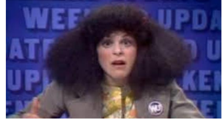
What are you trying to do? Make me sick?